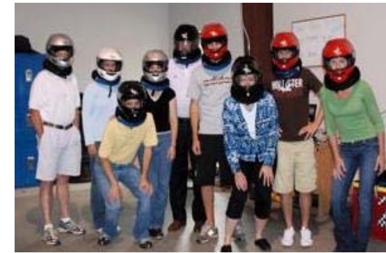
At left: Chamber Speed-Racers at RushHour Karting in Garner for a Volunteer Appreciation Outing in June.