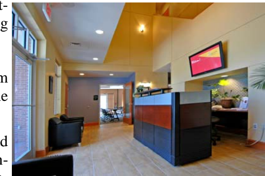
Chamber aims to increase use of its state-of-the-art facility through member rentals.

Top priorities for the year ahead include issues regarding government affairs/economic development, membership, and communication. In reference to government affairs/economic development, the Morrisville Chamber aims to improve its visibility and